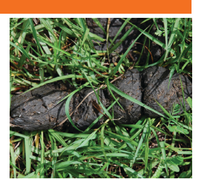
Swine feces vary in size and color depending on local diet