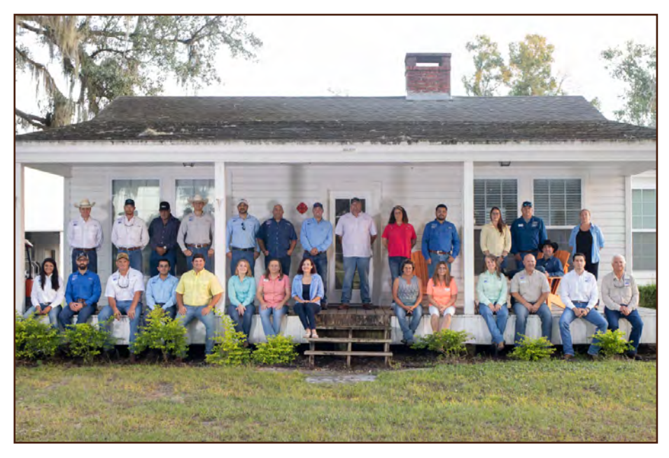
Early morning group photo of faculty, staff, and students taken before the 10/24/19 field day.