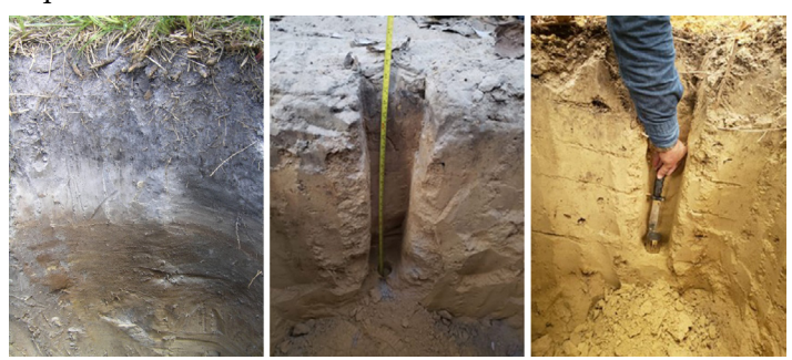
Figure 2. Deep soil carbon evaluation.

zone (Figure 2), which often extends beyond the minimum of 12 inches recommended by the Intergovernmental Panel on Climate Change (IPCC) or the typical 6 inches for soil fertility purposes. The extensive labor requirement for sampling and analysis cost should be considered in the design of carbon credit programs if measured verification is required.