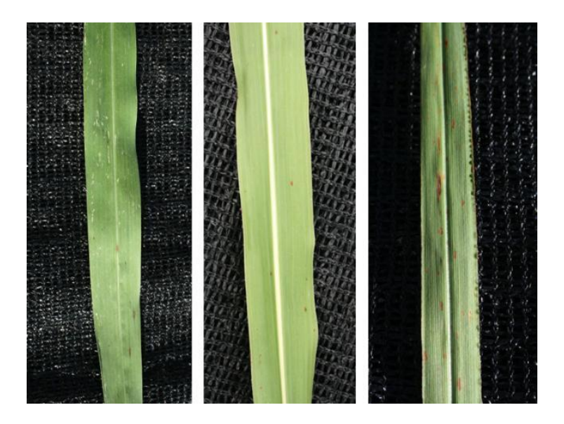
From left to right, guinea grass leaf blade; johnsongrass leaf blade; vaseygrass leaf blade.

Johnsongrass is a common perennial grass that grows throughout the South and Midwest. It is so common and well known as a troublesome weed that any large undesirable grass is often called johnsongrass. Distinguishing between johnsongrass, guinea grass and vaseygrass can help determine treatment options. All three grasses have a prominent white midrib that extends the length of the leaf. But few similarities exist beyond this characteristic. All three grasses are perennial, but only johnsongrass has a creeping rhizome system and grows in patches rather than in individual bunches. Vaseygrass and guinea grass are both bunch-type grasses without a significant rhizome system. Additionally, vaseygrass is most commonly found in wet fields or along drainage ditches. Johnsongrass and guinea grass prefer drier sites. Johnsongrass and guinea grass have an open panicle seedhead that is angular. Color and size are the key differences between johnsongrass and guinea grass seedheads. Johnsongrass seeds are much larger and have a red/black mottled color, while guinea grass seeds are smaller and somewhat green. Vaseygrass has a very different seedhead with alternating spikelets forming silky hairs around the seeds. Seeds are produced along the entire length of the seedhead branch, which does not occur in johnsongrass or guinea grass seedheads. For more information and control protocols, see EDIS publication SS-AGR-363.