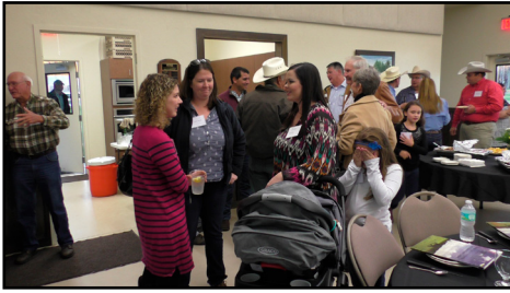
(L-R) Group visit during the reception.

The Mosaic Grazinglands Classroom was the sight of the 2016 donor recognition reception and dinner on February 5 with about 54 guests in attendance. This gathering of friends of the Center is a new tradition, allowing a special evening to thank those who support the Center and its programs.