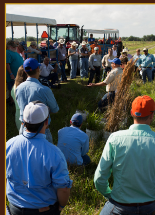
Field Day April 2015