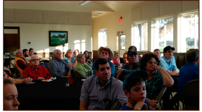
There were 80 in attendance for this year's gathering. Here is a view of attendees during the awards and recognition program.