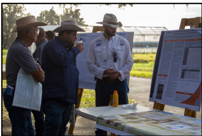
Viewing grad student posters.