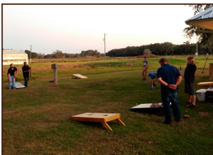
Attendees enjoyed corn hole games, volleyball, and visiting.