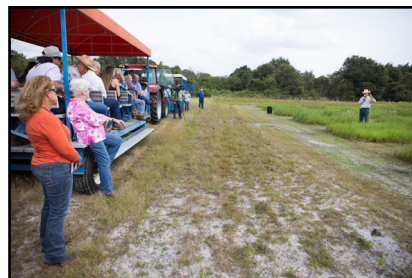
Afternoon field tour stop.