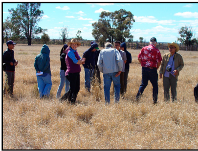
Tour to visit producers with group from Indonesia.