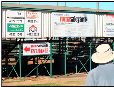
Roma Cattle Sale Yard - 7,000 animals sold per week.