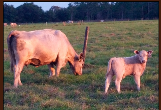
Ona White Angus foundation cow and White Angus calf.