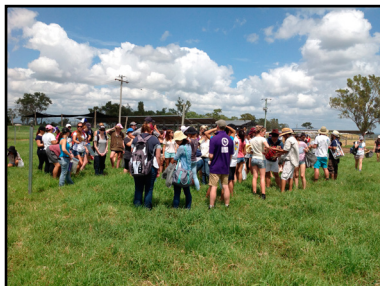
Undergraduate Forage class.