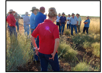
Leucena Field Day.