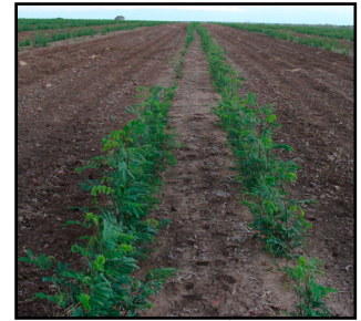
New planting of leucena.