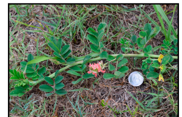
Creeping Indigo Indigofera spicata

- a poisonous non-native plant that has become a concern in Florida pastures.