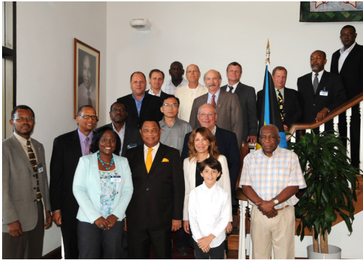
UF faculty with the Prime Minister of the Bahamas.