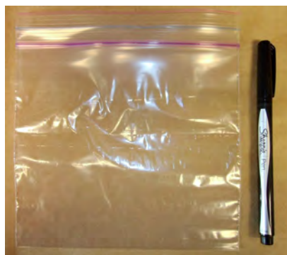
Sample size should be at least enough to fill a sandwich size ziploc bag.