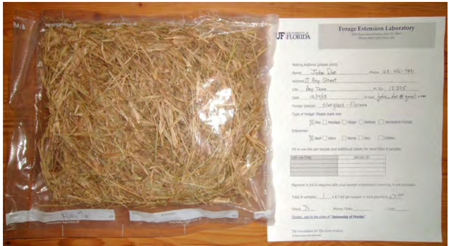
Example of a hay sample with the completed form.

This article was previously published in The Florida Cattleman and Livestock Journal, July 2009.