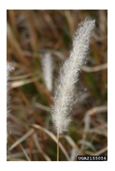
Figure 3. Seed heads of cogongrass are fluffy and white. Nearly 3,000 seeds can be produced per plant.