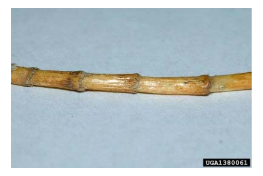
Figure 4. Rhizomes of cogongrass are segmented (have nodes), where new shoots are able to grow.