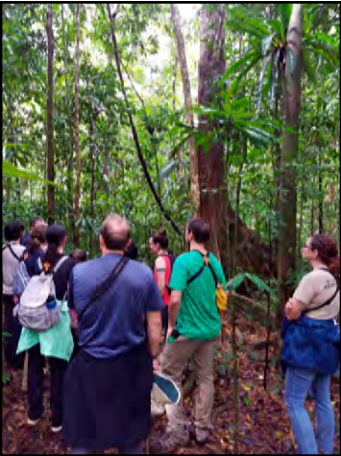
Pic. 1. Oldest Gondwana Rainforest.