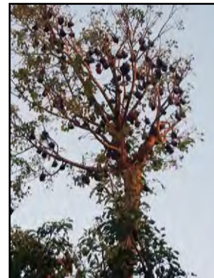
Pic. 4. Bats at roost.

After the study abroad program, Raoul Boughton and his family spent time in the much cooler climates of south Australia camping and hiking in remote national parks (Pic. 5).