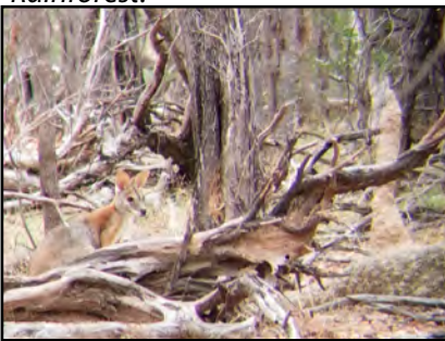
Pic. 2. Black striped wallaby.