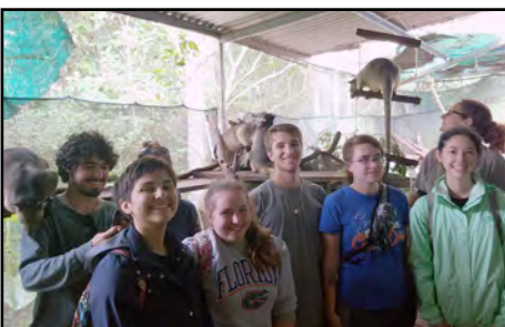
Pic. 3 Tree-kangaroo rescue Center.