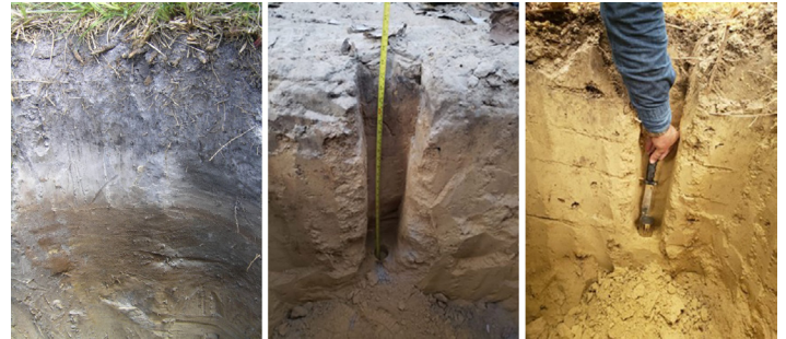
Figure 2. Deep soil carbon evaluation.

zone (Figure 2), which often extends beyond the minimum of 12 inches recommended by the Intergovernmental Panel on Climate Change (IPCC) or the typical 6 inches for soil fertility purposes. The extensive labor requirement for sampling and analysis cost should be considered in the design of carbon credit programs if measured verification is required.