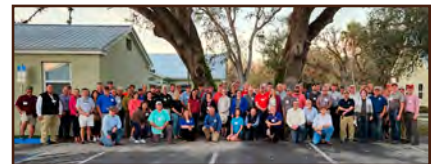
2/7, The Research Center Administrators Society (RCAS)