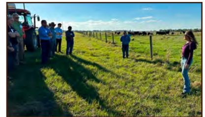
2/27, UF/IFAS AI External Advisory Board