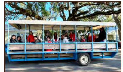
3/14, Links 2 Success, DeSoto Co. teen group