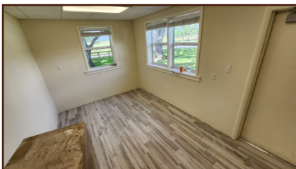
LTAR lab building with flooring done