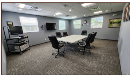
Grad student collaboration room