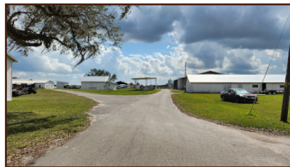
Farm side - new roof on the right

Six months after Ian’s damaging flood, recovery efforts continue. In addition to the grad student house and the education building, the soil and water and agronomy labs, along with the cattlemen’s conference room are now restored. Structurally, the administration building is nearly complete, but it is being used for temporary offices by all the faculty, staff, and students waiting on their buildings to be finished. The wildlife lab, the animal science lab, the LTAR lab, and the weed science lab are still works in progress.